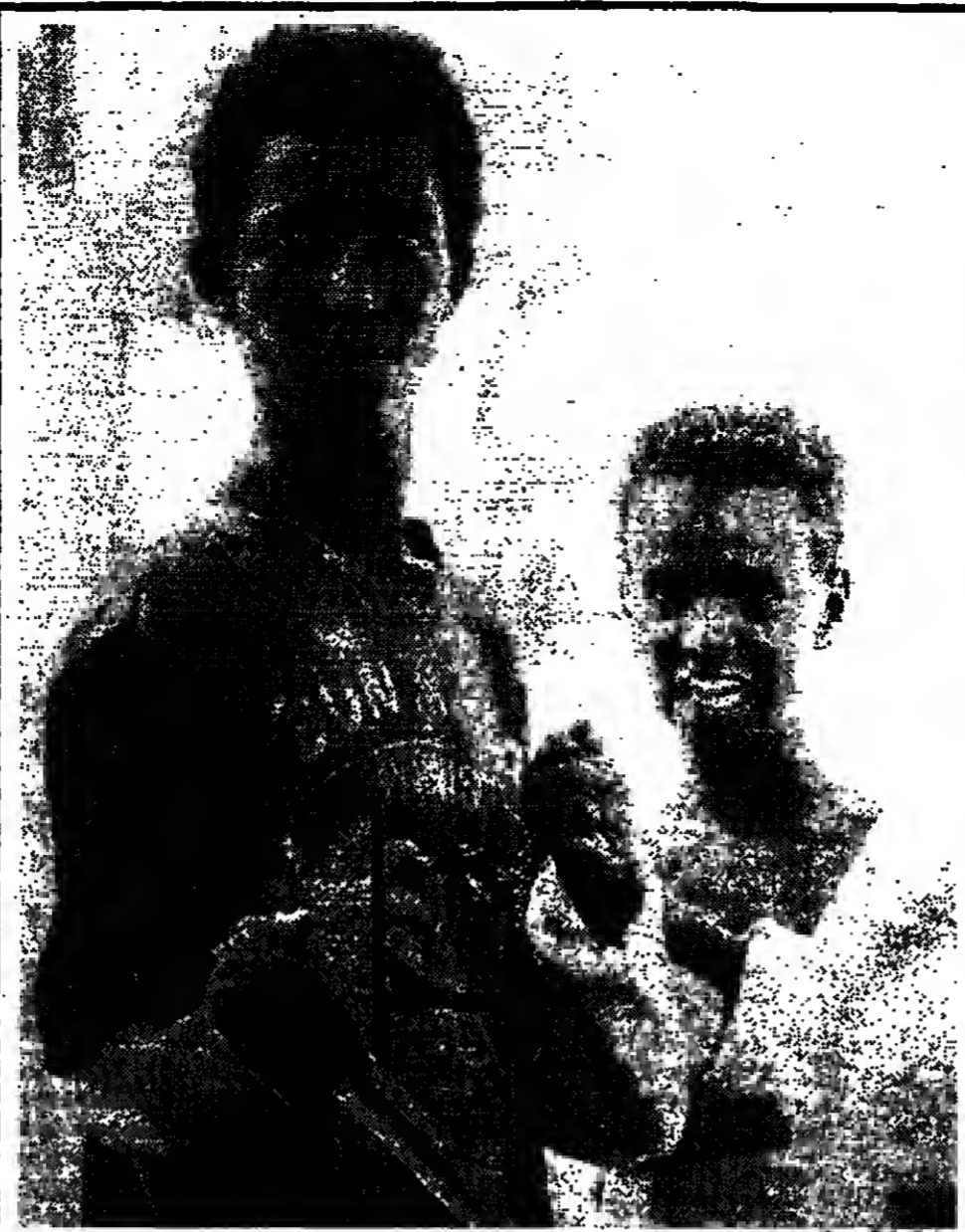
BAITLE-READY — Two brothers, members of a clan supporting the Somali warlord Colonel Omar Jess, preparing to fight members of a rival clan backing General Mohammed Said Hersi Morgan in Kismayo. In Mogadishu, a U.S. Marine committed suicide for unexplained reasons and two French soldiers were killed in a road accident, a U.S. military spokesman said.

The police said Sunday that three people have been arrested in connection with an ambush Friday in which 10 blacks were shot to death in Natal Province. Reuters reported from Johannesburg. The police earlier speculated that the ambush was intended to avenge the deaths of six children in the same area on Tuesday. Three arrests have been made in connection with that killing.